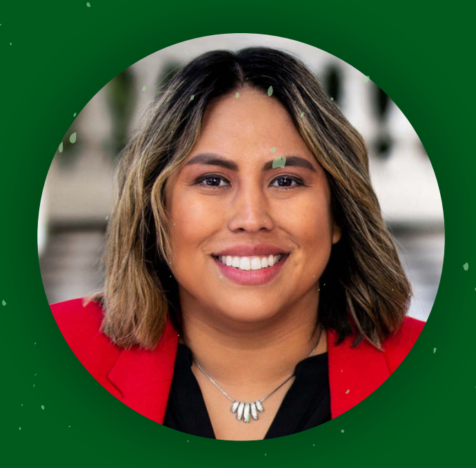
California Senator Caroline Menjivar