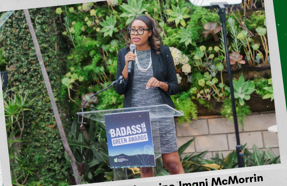
Culver City Mayor Yasmine-Imani McMorrin provides opening remarks at the 2024 awards